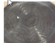
Discolouration of the external base