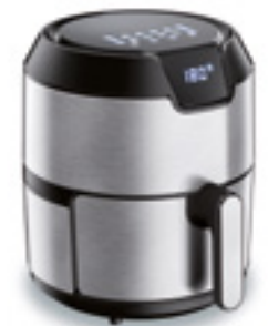
EASY FRY DELUXE