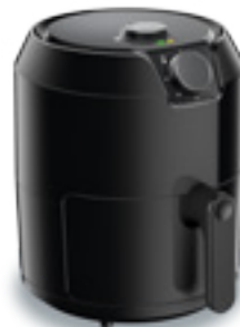
EASY FRY CLASSIC