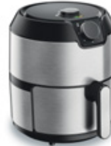
EASY FRY CLASSIC +