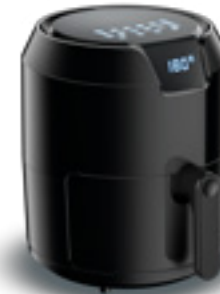
EASY FRY PRECISION